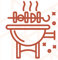
Open Air Buffet Area