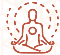
Yoga & Meditation Plaza