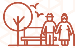
Senior Citizen Sitout